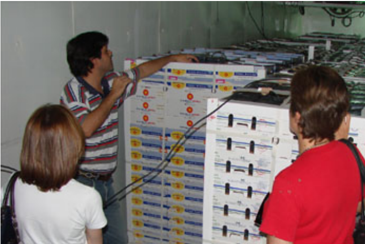
Methyl Bromide fumigation/ Fumigación con bromuro de Metilo

The Uruguayan Ministry of Agriculture (MGAP) requested the Argentine Animal Health Service (SENASA) for cooperation in a visit to a Methyl Bromide (MB) fumigation facility for the treatment of blueberries in Concordia, Argentina. The United States Department of Agriculture – Animal and Plant Health Inspection Service (USDA-APHIS) was on hand to answer question from the MGAP officials regarding the operation of the fumigation chamber and the exportation to the US of treated blueberries. Uruguay foresees the eventual approval to export their blueberries to the US under the required fumigation treatment for Ceratitis capitata and Anastrepha fraterculus , which are two pests that have been proven to attack blueberries in this region of South America.